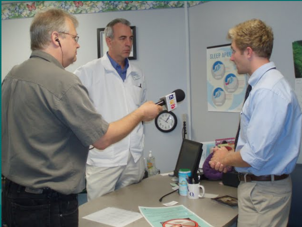
Pharmacy Waste Outreach Program October 19, 2009