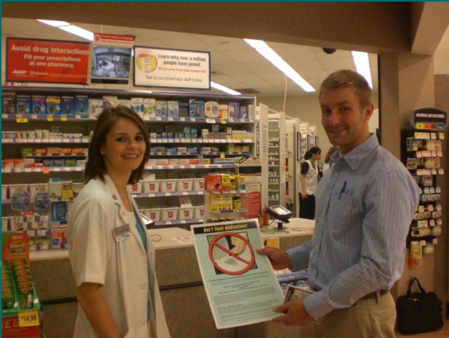
Pharmacy Waste Outreach Program October 19, 2009